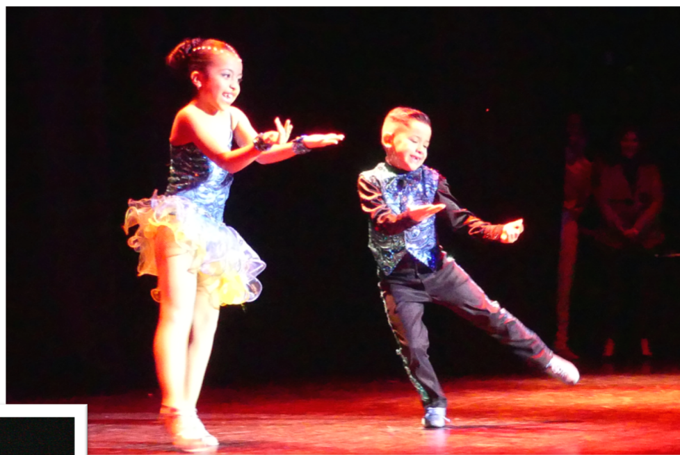
Participants in the show