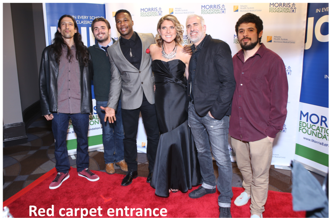
Red carpet entrance