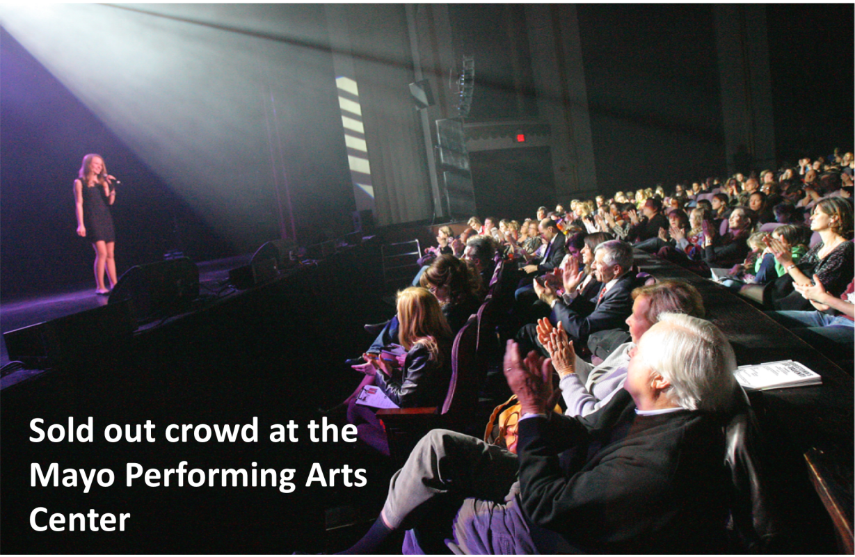
Sold out crowd at the Mayo Performing Arts Center