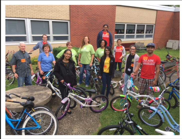
4 th Grade bike program