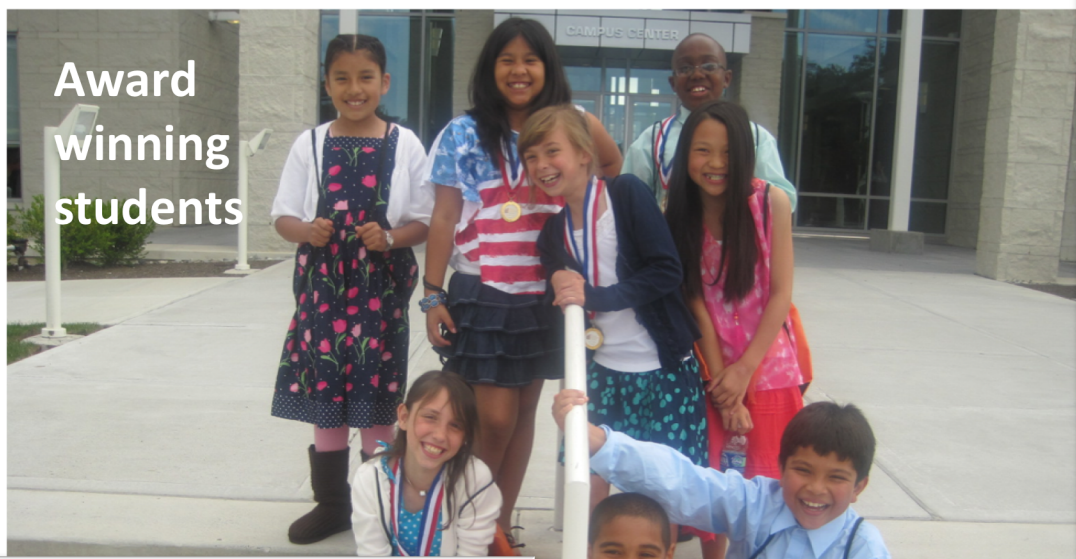
Award winning students