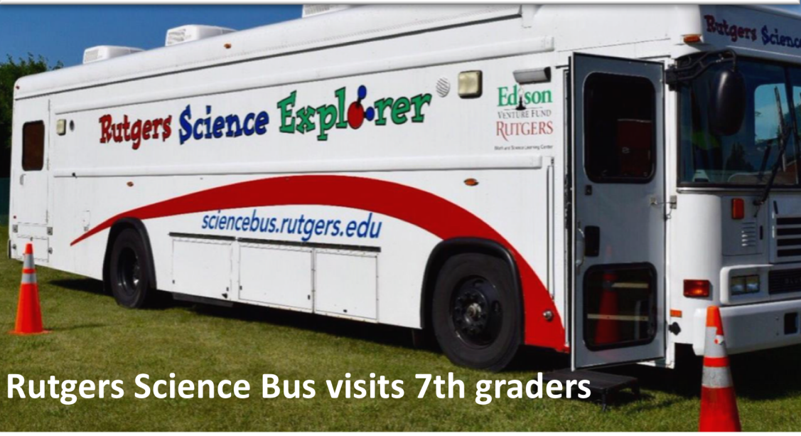
Rutgers Science Bus visits 7th graders